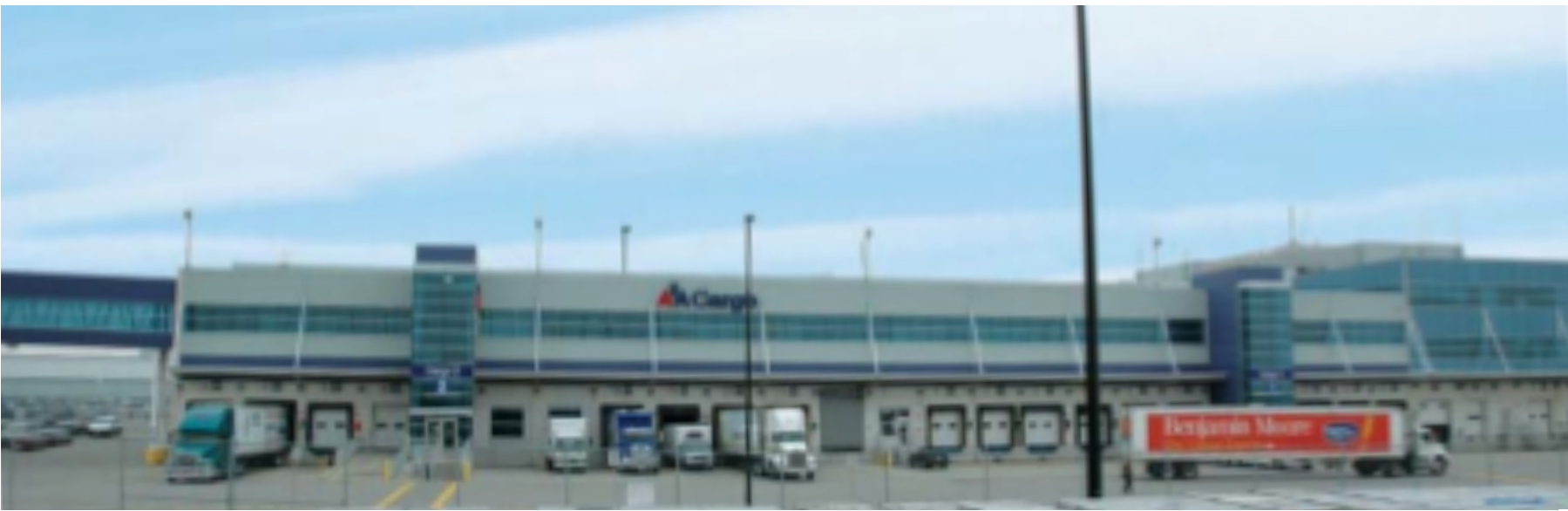
renovation of tenant space at “Cargo 3 warehouse”, Pearson Airport Sievenpiper Associates Inc.