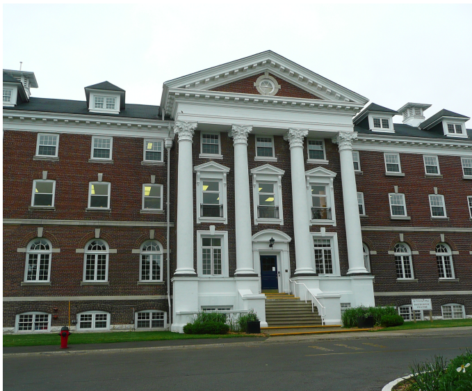
Pickering College entry rehabilitation Goldsmith Borghal Corporation Architects (GBCA)