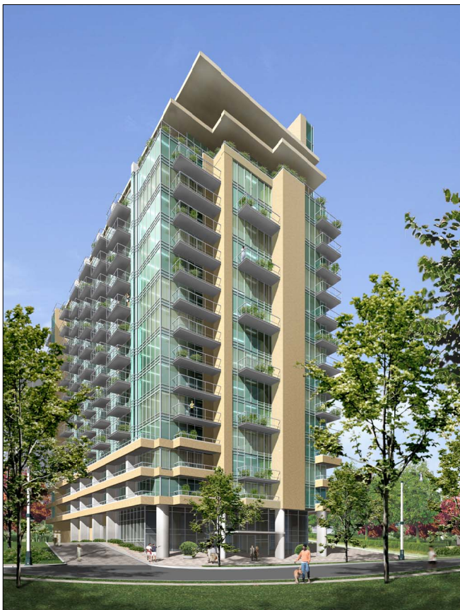
Liberty Village Condominium IBI Group Architects Site Plan Approval drawings rendering by others on cover sheet