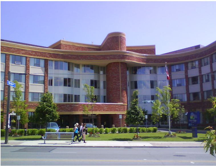
New Chester Village Seniors Long Term Care Sievenpiper Associates Inc. Personal photography