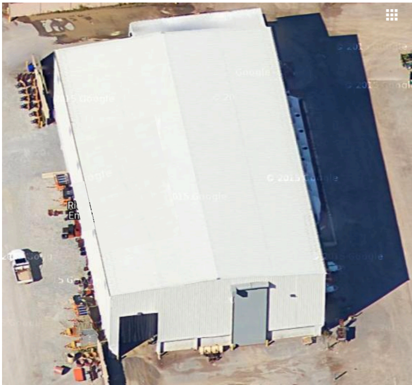
new 11,000 ton salt shed Municipal Operations Centre, Town of Richmond Hill