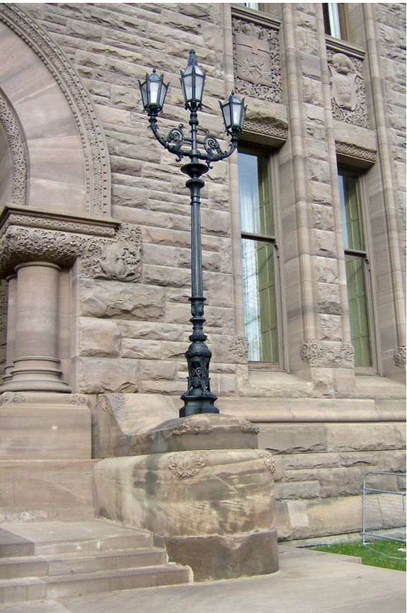
Tripartite lights restoration Goldsmith Borghal Corporation Architects (GBCA) documentation drawings to assist conservation team