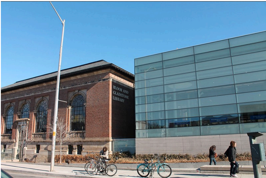
renovation and addition Bloor Gladstone Library

Rounthwaite Dick & Hadley Architects Inc. Image: satellite view from Googlemaps.ca