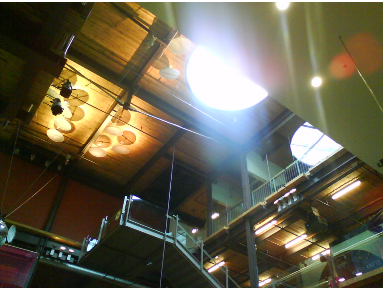
Kitchener Waterloo Childrens' Museum Levitt Goodman Architects