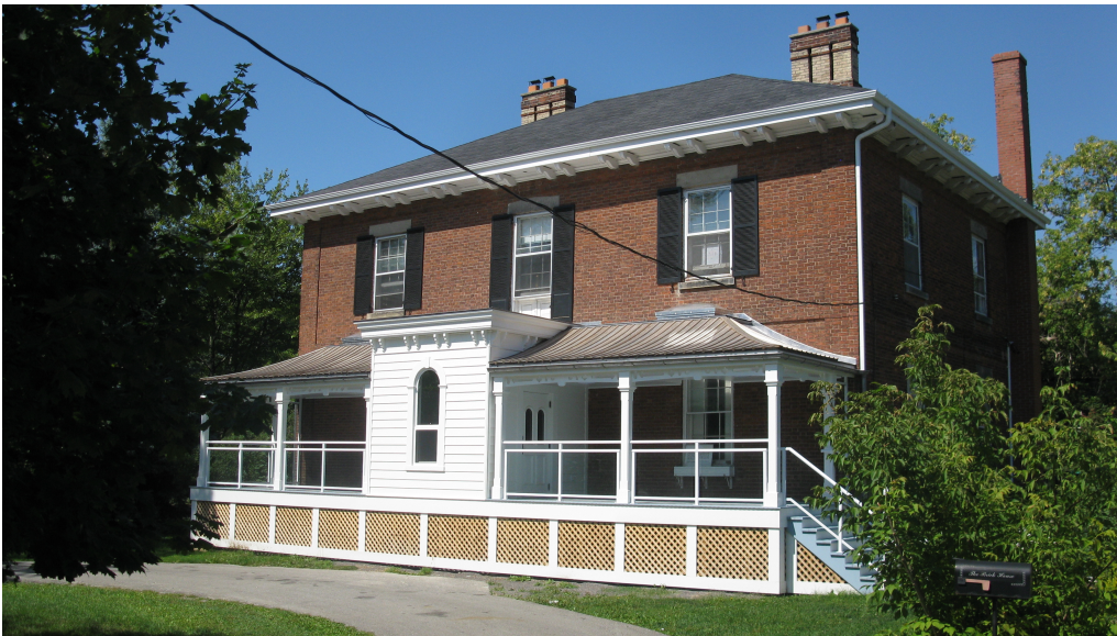
Heritage work for Goldsmith Borghal Corporation Architects (GBCA)