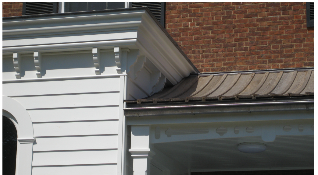
Details at “Brick House” in west end Toronto ( GBCA )