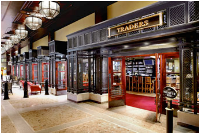
Sheraton Centre Hotel, Toronto lobby renovations: bar + motor court Sievenpiper Associates Inc.

Rounthwaite Dick & Hadley Architects Inc. (ERA Architects Inc., Heritage subconsultants)